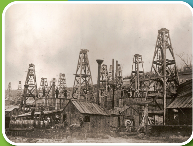
Working for Pennsylvania's oil & gas industry since 1918

PIOGA is the trusted voice for the industry in Pennsylvania and provides timely and affordable advocacy for its members. PIOGA's member-based actions on legislative and regulatory issues are swift and decisive. PIOGA's committees are open and interactive and provide concise information on a regular basis for its members. PIOGA operates education and outreach programs to promote and expand the products it represents.